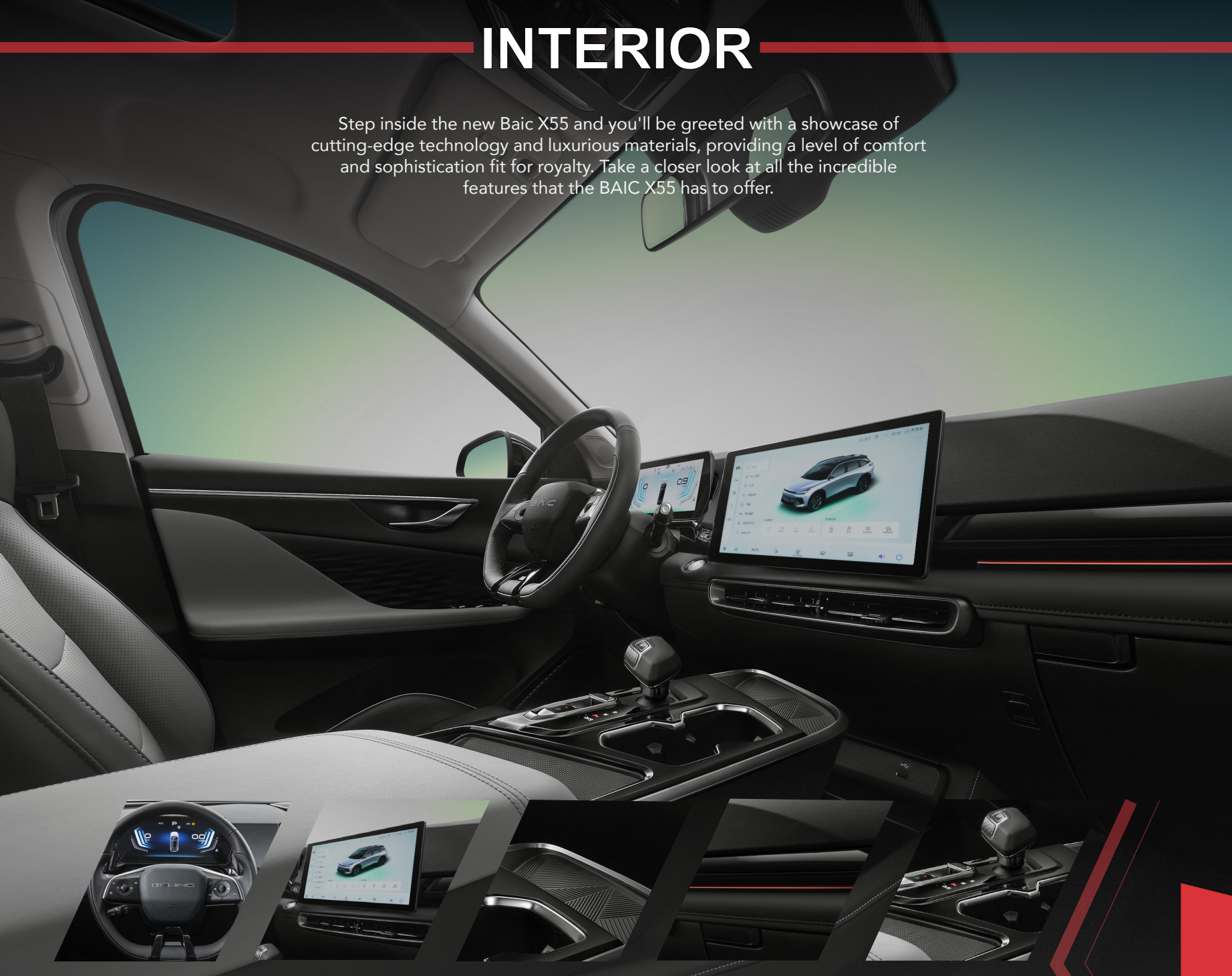
Multi-function steering wheel with 4-way adjustment

Step inside the new Baic X55 and you'll be greeted with a showcase of cutting-edge technology and luxurious materials, providing a level of comfort and sophistication fit for royalty. Take a closer look at all the incredible features that the BAIC X55 has to offer.